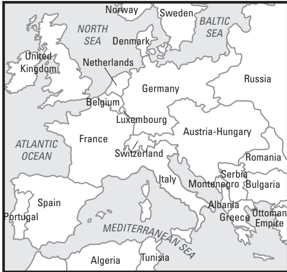
Europe Before World War I (1914)